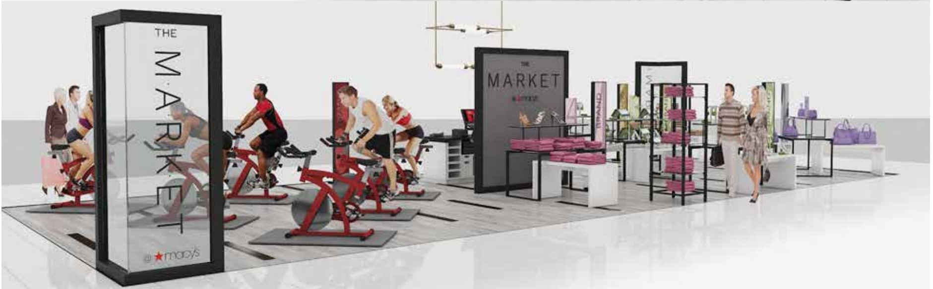
The Market @ Macy's Rendering (Alternate Views)