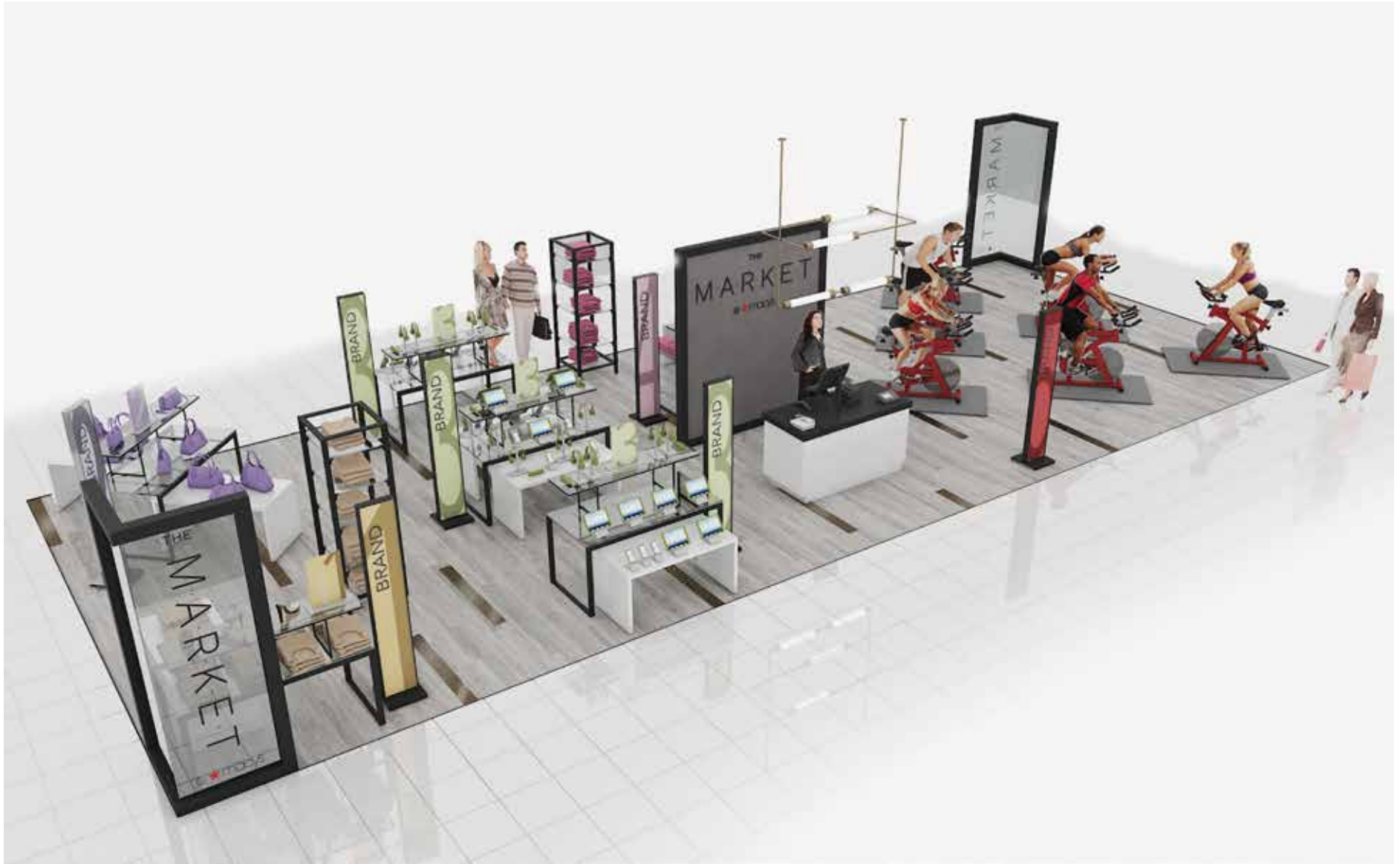
The Market @ Macy's Rendering